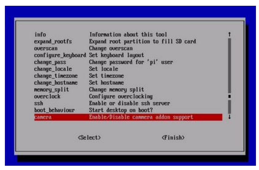
Figure 2: Enable camera

3) Select Enable camera and hit Enter, then go to Finish and you'll be prompted to reboot.